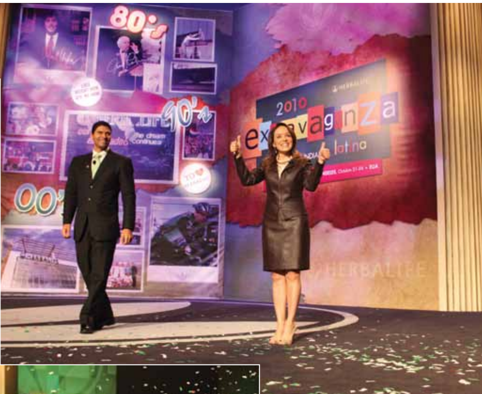
Attendees were treated to a variety of entertainment, from elegant dining to enthusiastic presentations.