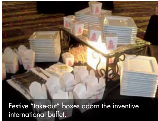
Festive “take-out” boxes adorn the inventive international buffet.